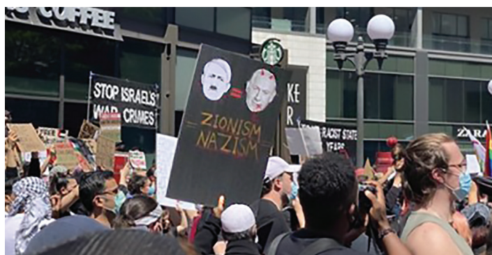
BELOW: A sign at a rally in Seattle, WA on May 16, 2021 shows Adolf Hitler side-by-side Israeli Prime Minister Benjamin Netanyahu, saying “Zionism=Nazism.”