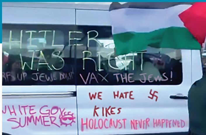
ABOVE: White supremacists in Boca Raton, FL on May 12, 2021, drove a van saying “Holocaust never happened” and “Hitler was right” while waving a Palestinian flag, to provoke Jews who were peacefully demonstrating in support of Israel.

On May 11, 2021 on the Daily Show, host Trevor Noah spoke about Israel’s military might, comparing Israel to himself, as a big brother, fighting with his younger brother: “As a person who has immensely more power, I had to ask myself whether my response to this child was just or necessary,” he said. “Could I find different ways to deal with this?” Noah is suggesting that because Israel “has more power,” it should not respond as forcefully when a terrorist organization—which is on record saying its primary goal is the destruction of Israel—is bombarding it with rockets.