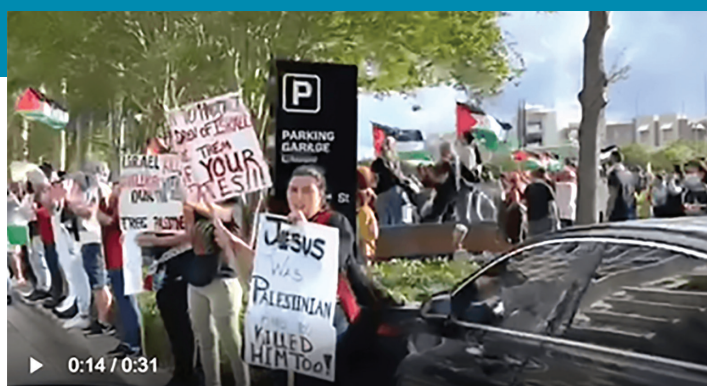
At a protest in Miami, FL on May 16, 2021, a sign says “Jesus was Palestinian and you killed him too!” The Deicide charge was also seen on signs and on social media.