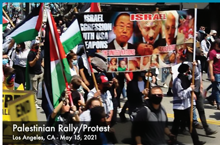
At a protest in Los Angeles, CA on May 15, 2021, protestors held a sign brandishing Israeli Prime Minister Netanyahu with a Hitler moustache eating a Palestinian child that is beyond offensive. The antisemitism conveyed in this image is centuries in the making.

The Blood Libel accuses Jews of murdering non-Jewish children to use their blood for ritual purposes, such as making Passover matzah. Blood libel charges have evolved from Medieval times into a widespread blame of Jews or Israelis for horrific crimes against Palestinian children, such as eating Palestinian children and drinking their blood, or purposefully targeting and killing them.