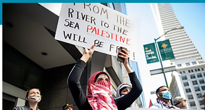
RIGHT: In San Francisco, CA on May 18, 2021, a sign says: “From the River to the Sea, Palestine will be Free!”

“From the River to the Sea” is a catch-all phrase that symbolizes Palestinian control over the entirety of Israel’s borders, from the Jordan River to the Mediterranean Sea. This saying seeks to eliminate the State of Israel and is a historic call-to-arms for terrorist groups and their sympathizers, from the Popular Front for the Liberation of Palestine (PFLP) to Hamas.